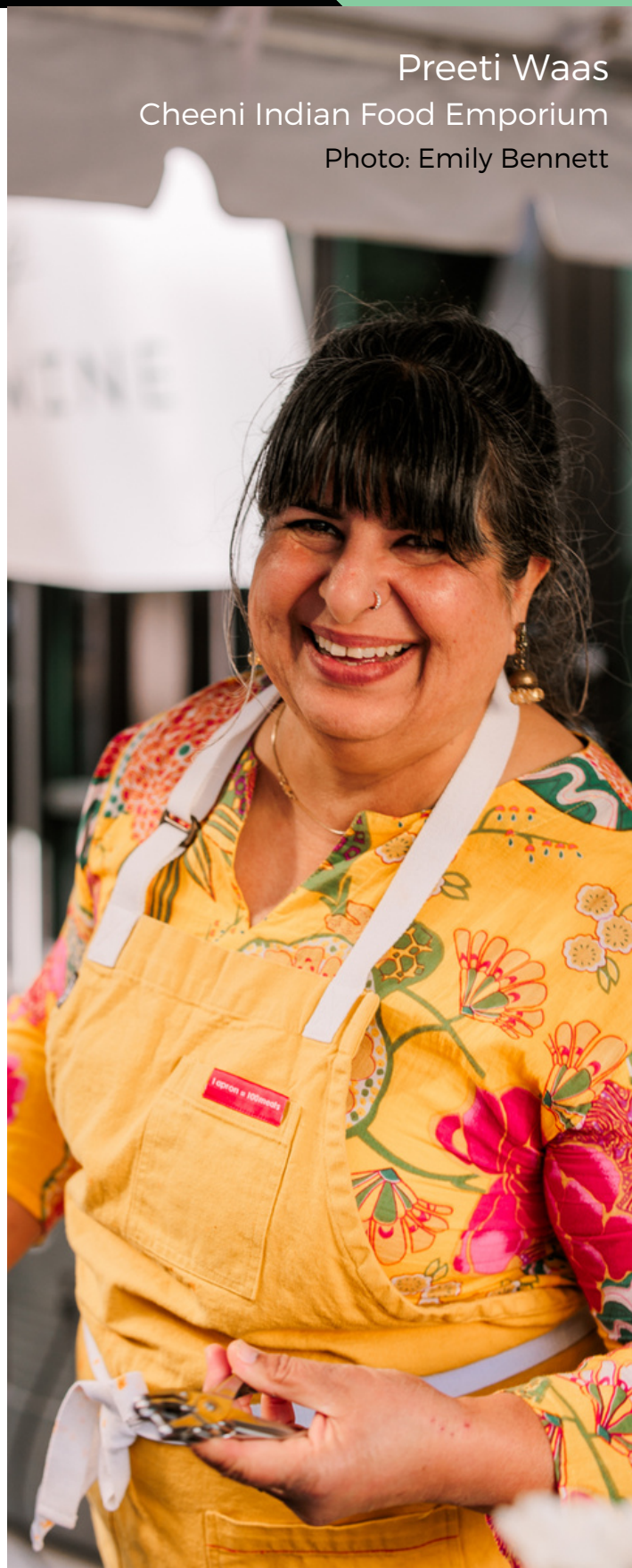
Preeti Waas Cheeni Indian Food Emporium